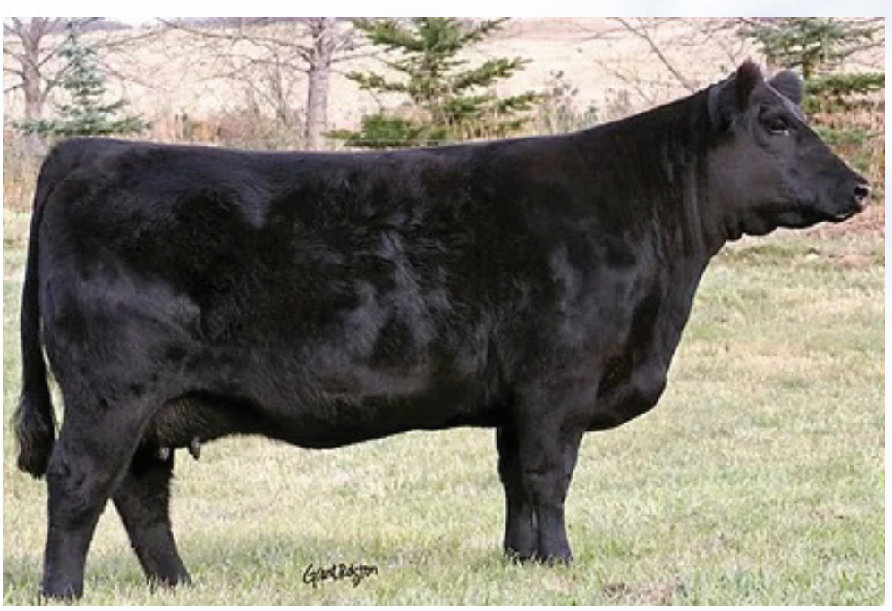
HF ECHO 187N | DAUGHTER OF ECHO 32E