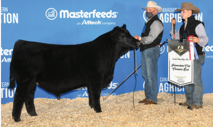
MERIT FLORA 1004J | DAUGHTER