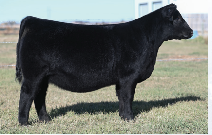
BLAIRSWEST ERICA 77J | ERICA DAUGHTER

Erica 74A is recognized as Canada's most decorated female in Angus cattle. A past CWA supreme champion but more importantly is her track record of production. From placing herdsires like Rocco (full sib to these eggs) to $69,000 heifer calves in the fall of '21 in the Opportunity Knocks sale to selling record pricing flushes literally all over the world. All in all have Erica within in your genetic pool. Renown is the stand by sire that is coming to more life than ever now. Course being the sire of Glacier, a $90,000 female for Meadowbridge in Ontario plus multiple others is just the current news on Renown. This is a major league mating that has endless opportunities.