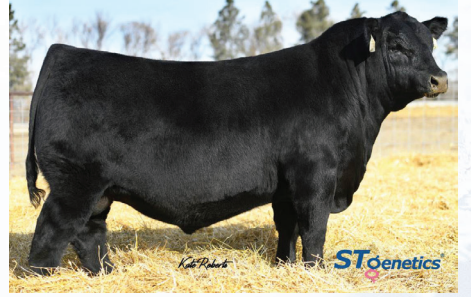
S A V MAGNUM 1335 | SIRE

MEAD MAGNITUDE S A V MAGNUM 1335 S A V EMBLYNETTE 9023 CE BW WW YW MILK 7.5 1.8 75 135 33