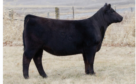
COLEMAN DONNA 2588 | DAUGTHER, SOLD FOR $16.500 TO ELMBANK FARMS