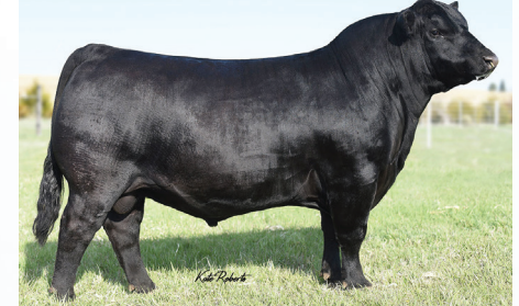
KR CASINO 6243 | SIRE

When you talk about blending some of the most sought after rare genetics that carry as much value as any made available in the world, this mating has to be at the forefront. Casino semen is now fetching $1600 a dose and climbing. Madame Pride 0151 is the dam of the now deceased sire SAV Renovation who had the lead off sire group and high seller at SAV this spring. The maternal genetics incorporated with 0151 and the extra added "look" Casino cattle carry makes this very exciting. Put your own tattoo on the resulting calf and reap the rewards of something extremely special and unique that will get worldwide recognition.