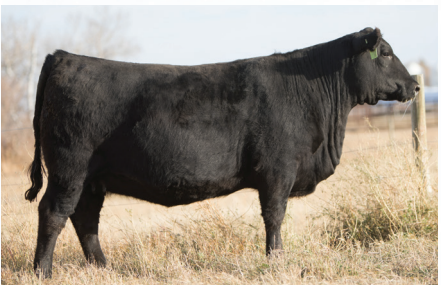
S A V STERLING 1766 | SIRE