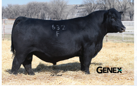
SITZ BARRICADE 632F | SIRE

SITZ STELLAR 726D SITZ BARRICADE 632F SITZ BARBARAMERE NELL 765D COSENZA DON ROBERTO 338 T/E BLAIR'S 2408 SARITA 547J LAFE 2408 SARITA CREDITO-FIV WM CE BW WW YW MILK 3.0 3.5 67 121 19