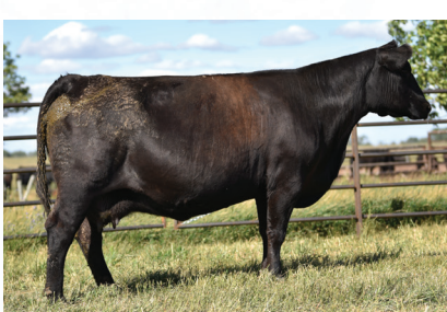
JL LADY 2151 | DAM