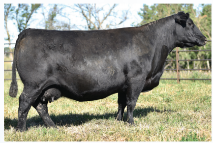
JL LADY 3059 | MAT SISTER TO DAM