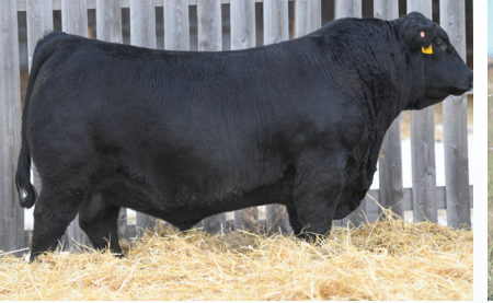
BLAIR'S ROCCO 268F | FULL SIB TO EMBRYOS