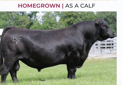
DEER VALLEY GROWTH FUND | SIRE