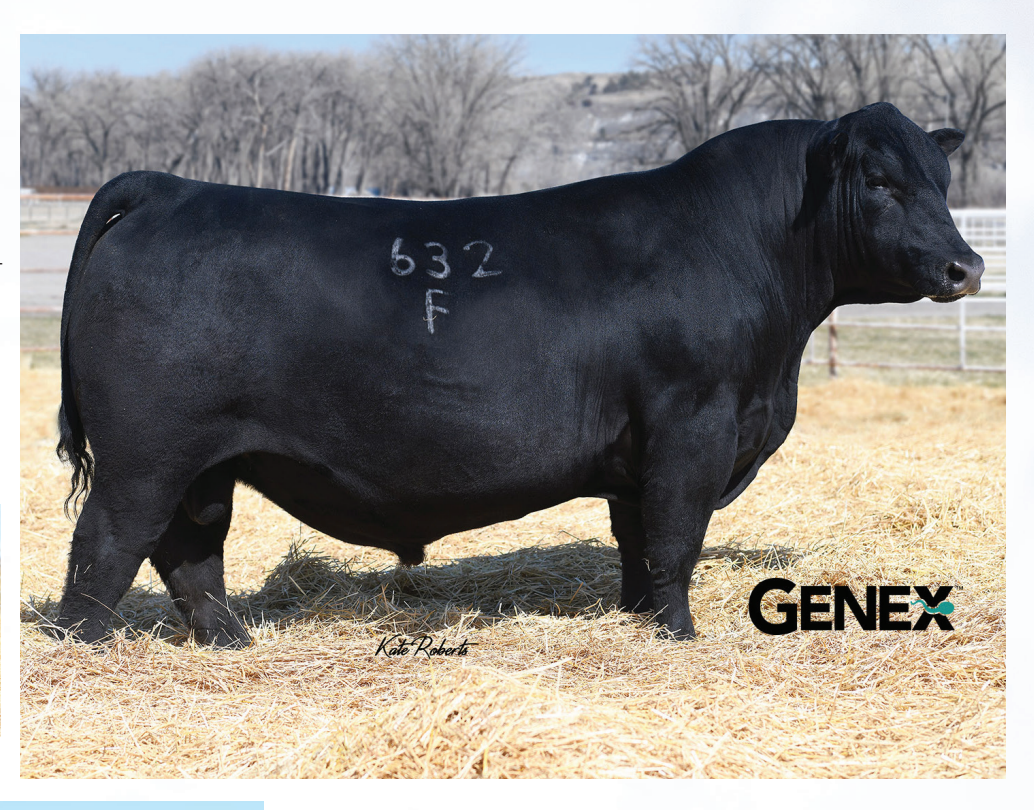
SITZ STELLAR | SIRE OF LOTS 18 AND 19