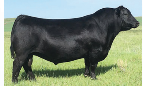
S A V PRESIDENT 6847 | SIRE