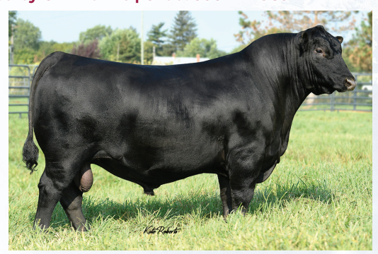
CRAFTSMAN | $500,000 RESILIENT SON

Consigned by CMT Farms | Chad: 306-441-9837